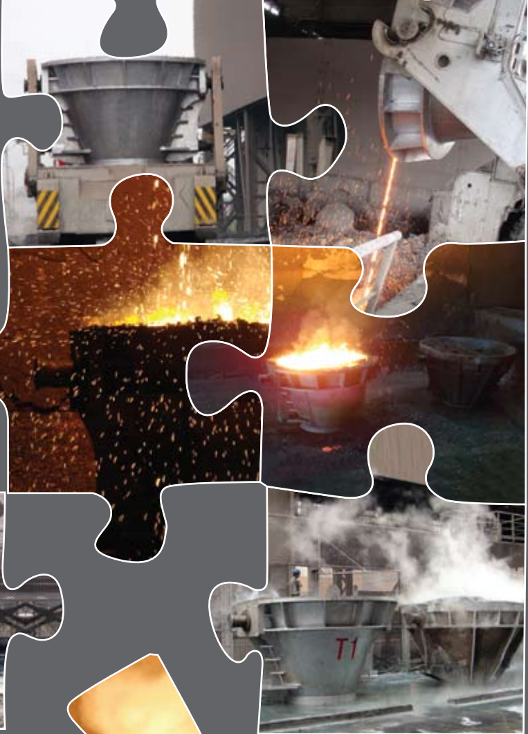
WELDED SLAG POTS IN OPERATION AT BAOSTEEL

WELDED SLAG POTS OFFER A LARGE NUMBER OF TECHNICAL AND ECONOMIC ADVANTAGES: